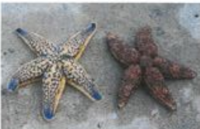
Introduced pest species Northern Pacific Seastar (left) & native Granular Seastar

The project was funded by the Federal Government 'Caring for Country' program and drew on the ongoing efforts of Earthcare St Kilda to remove North Pacific Seastars from St Kilda Harbour since 2004. It involved liaison and collaboration with numerous stakeholders including Earthcare St Kilda, Parks Victoria, Victorian Department of Environment & Primary Industries, Deakin University, Reef Watch and Polperro Dolphin Swims.