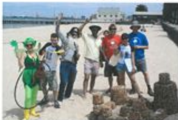
Crew from Earthcare, EcoCentre, City of Port Phillip, 3206 and 3207 Beach Patrol at Middle Park Bay Care day

In 2012 the Victorian Environment Protection Authority invited EcoCentre and Marine Care Ricketts Point to submit project proposals which might be funded through a Magistrate's Court order. The groups decided on a joint proposal to deliver a series of community "Bay Care events" and produce publications to promote participation in the ongoing activities of key local groups.