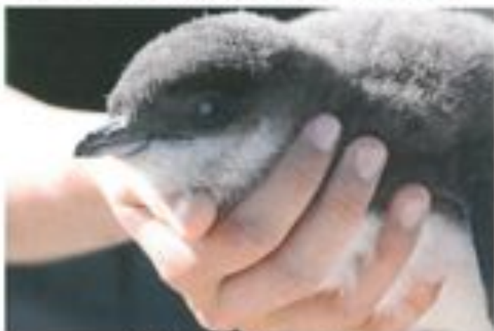
What all the fuss is about.

In accordance with Action 1 of the Action Plan, monitors relocated penguins from construction designated zones on 286 accounts and placed these birds in the water.