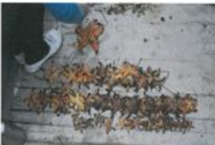
Earthcare citizen scientist measuring the catch