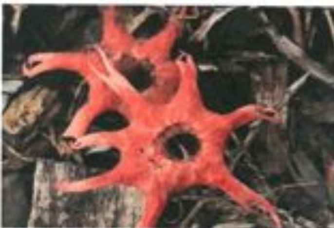
Stinkhorn or red starfish fungus

The Friends of Westgate Park have completed another successful year enhancing biodiversity at Westgate Park. Almost every day in the year saw some activity in the park: planting, mulching, weeding, seedling propagation, guided walks, fungi mapping, bird surveys, checking water quality, educating school children on biodiversity or the back-breaking task of repairing roads and tracks. In addition to this very important on-ground work, the