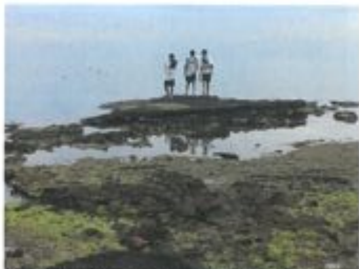
Sandringham Secondary College exploring Ricketts Point

Teacher, Montague Continuing Education Centre