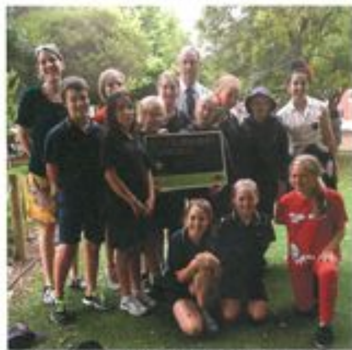
Elwood PS celebrate their first ResourceSmart star!