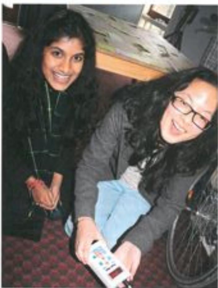
MacRobertson Girls' High students learn how to conduct an Energy Audit at Green My School

Secondary student participant in Environment Resource Management Green My School