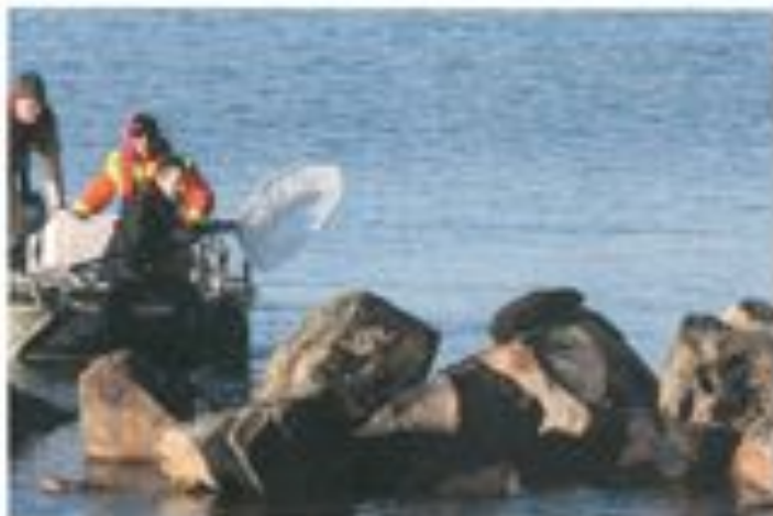
Melbourne Zoo wildlife experts move to relocate the visiting sub-Antarctic fur seal

An unexpected drama unfolded during July as penguins began to show signs of breeding activity and the need to complete the construction became all the more urgent. A young sub-Antarctic fur seal decided to holiday in St Kilda and took up residence in the construction zone. Following consultation with wildlife authorities, staff from Melbourne Zoo were called in to safely relocate the seal, enabling the construction to be completed soon after.