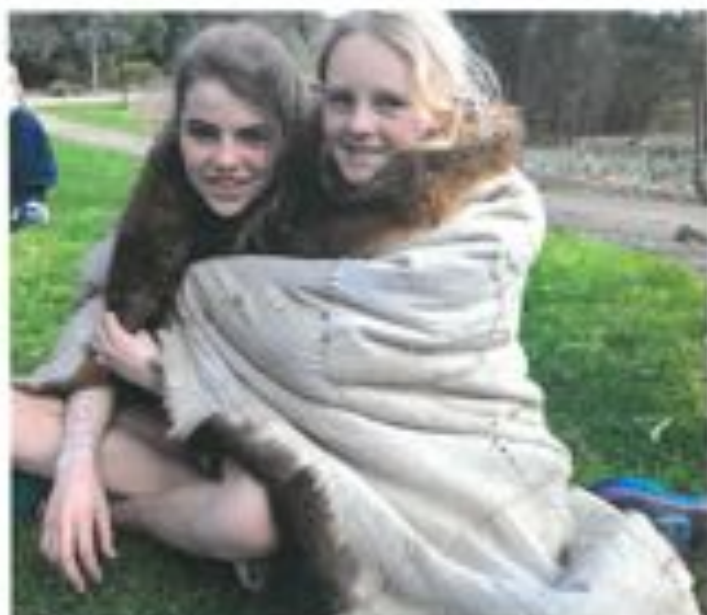
Elwood PS environment leaders in a possum skin cloak at Westgate Park

Our School's Team partnership with the Boon Wurrung Foundation has grown in 2013 with more bookings of Aboriginal educators conducting sessions that have complimented in-school programs and excursions.