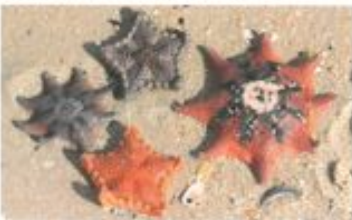
Natives: Eight-armed Seastars & Biscuit Seastars

The Best Practice Guidelines for Removal of Northern Pacific Seastars were based on research of relevant literature, land manager policies and practices, and dive industry standards. Content was also gathered through liaison with Earthcare seastar collection activity organisers and practical involvement in collections.