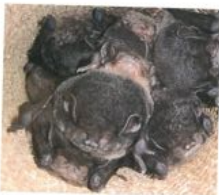
Gould's Wattled bats snuggled in one of Gio's 'bat tubes' in St Kilda Botanical Gardens

Another skilled volunteer has been recruited to map the locations of nest-boxes, which will prove to be an invaluable resource regarding future monitoring and the growth of the program.